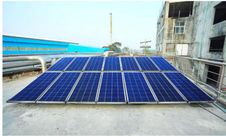
Solar Panels will be installed to power the lighting of the entire factory premises and its outside facilities.