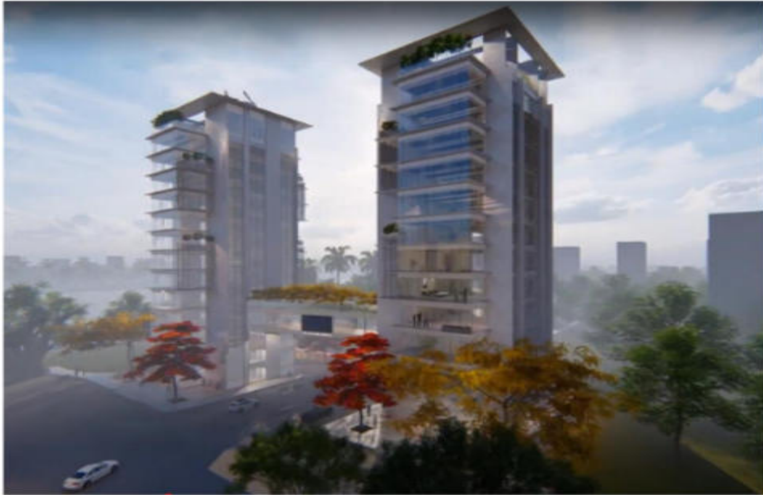
ASHIQUE TOWER 1 & 2